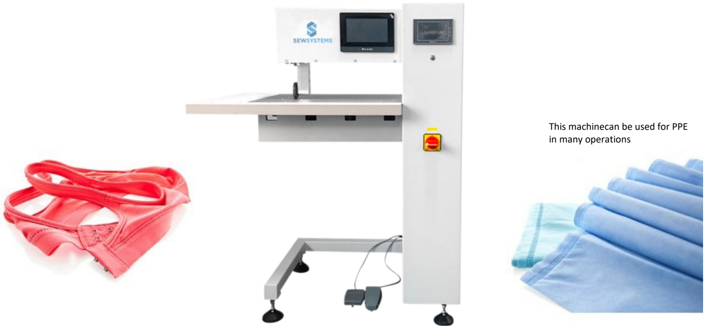
This machine can be used for PPE in many operations

This machine works like an ultrasonic sewing machine, with top and bottom patterned rollers both mounted vertically give this 35khz machine a very positive narrow width drive.